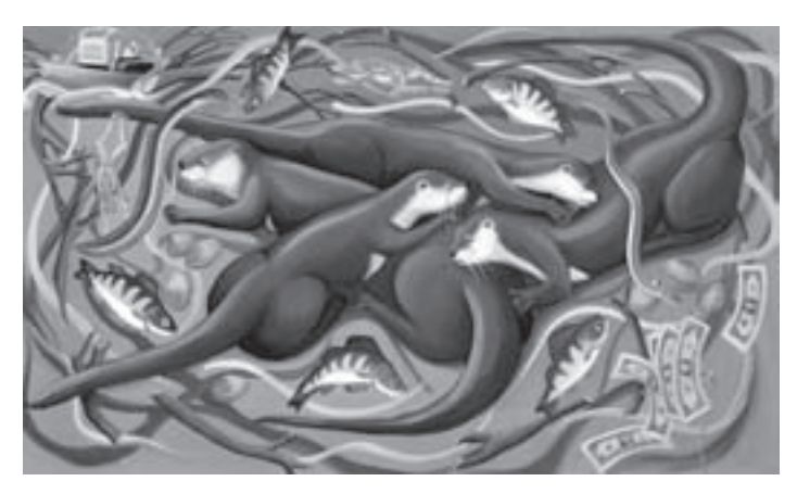
Red Fox, 2006, oil on canvas 30 x 36 inches