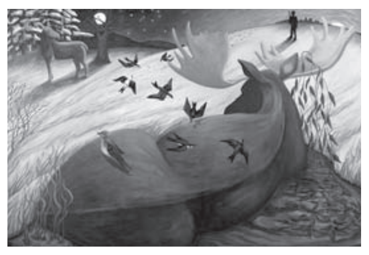
Moose 2006, oil on canvas 42 x 64 inches

This is a series I have been working on for the last three years. I have been actively involved in wildlife protection issues in the State of Maine for some time now. My work over the last few decades has reflected my concern for the increasing lost of wild lands in the state. When one is working on habitat protection and it feels like the battle is being lost, the message can often become negative and ireful. In this series, I wanted to present a balance of the positive and negative forces present in the lives of the wild animals residing in our state. I chose the dreaming state because it opens the possibilities of depicting each animal's friends and foes. The magic of art is that one can take possibilities and turn them into visual realities. We do not know if animals have visual dreams but I like to think they might. If they do dream as we do, the images that cross their minds would most likely contain foods that they love to eat, predators they may fear, and mates and offspring that they hold dear. I chose animals that I have observed and admired in the wild for many years. I also enjoyed researching each animal further for this series to find out more about their food and habitat preferences. This series is my way of sharing the love and admiration that I have for the fellow creatures that share with us this great State of Maine.